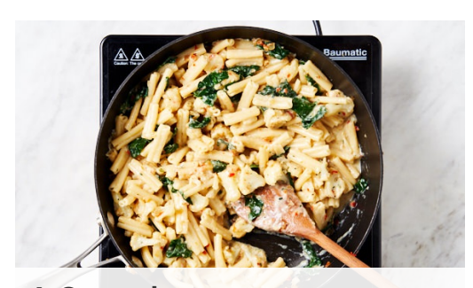
6. Get ready to serve

Meanwhile, put hazelnuts in a cold large deep frypan over medium heat. Toast, tossing, for 3-4 mins until golden. Remove from pan, cool slightly, then coarsely chop. Heat 60ml (¼ cup) olive oil in the same pan over high heat. Cook cauliflower , onion , garlic , chilli and thyme , stirring regularly, for 4 mins or until cauliflower starts to brown.