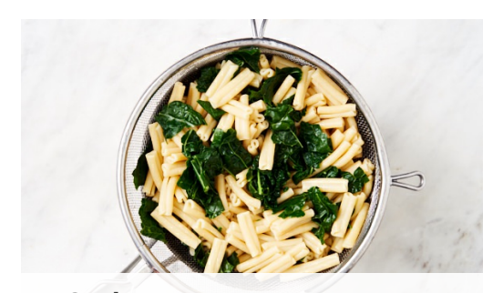
4. Cook pasta

Cook the cauliflower in the pan of boiling water for 3 mins or until softened slightly. Remove with a slotted spoon and pat dry with paper towel. Return the water to the boil.