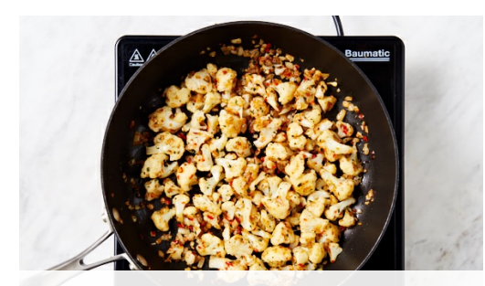
5. Cook cauliflower

Cook the pasta in the pan of boiling water for 9 mins or until al dente, adding the kale in the last 2 mins. Reserve 250ml (1 cup) pasta cooking water , then drain.