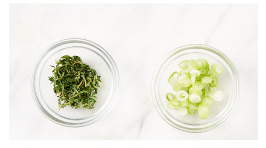
5. Prepare aromatics

While the potato is cooking, heat 1 tsp olive oil in a medium frypan over high heat (see cooking tip). Season the steaks with salt and pepper. Reduce the heat to medium-high and cook the steaks for 3-4 mins each side for medium-rare or until cooked to your liking. Transfer to a plate and rest for 4 mins. Reserve the pan.