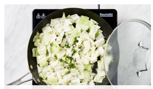
6. Finish colcannon

Meanwhile, finely chop the thyme leaves. Thinly slice the spring onion . Melt 20g butter and 1 tsp olive oil in the reserved pan over medium heat. Add the cabbage , thyme leaves and 2 tbs water . Cook, covered, for 6-8 mins until the cabbage is wilted.