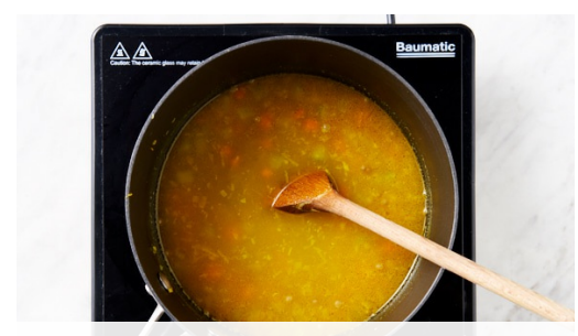
4. Finish soup

Heat 1 tbs olive oil in a medium saucepan over medium-high heat. Cook onion , carrot and celery , stirring occasionally, for 4-5 mins until softened.