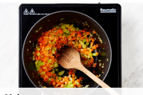
3. Make soup

Finely grate the zest of half the lemon** , then juice the half.