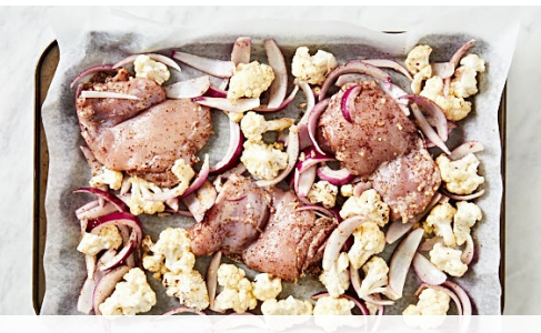
3. Roast chicken mixture

Combine the sumac , three-quarters of the garlic and 1 tbs olive oil in a large bowl and season with salt and pepper . Add the chicken , cauliflower and onion and toss to coat.