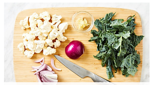
1. Prepare ingredients

Energy 760kcal, Fat 41.9g, Carbs 44.4g, Proteins 42.3g