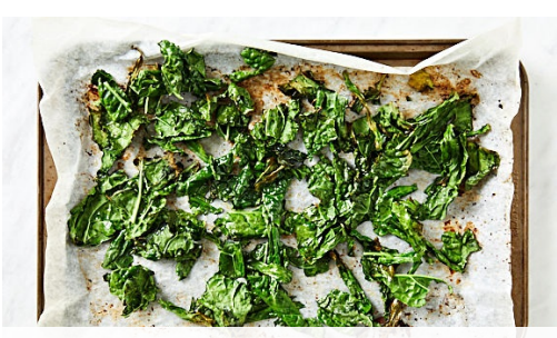
6. Roast kale

Finely grate the lemon zest, then juice. Whisk together the lemon zest , 1 tbs lemon juice , remaining garlic , 1 tbs tahini** , 1 tbs extra virgin olive oil and 1 tbs water in a bowl. Taste, then season with salt and pepper . Put the kale on the reserved tray, drizzle with 2 tsp olive oil and toss to coat.