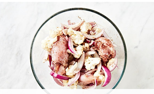
2. Make sumac marinade

Read through the recipe . Heat the oven to 220C (see cooking tip). Line an oven tray with baking paper. Chop the garlic , then press with the flat side of a knife to finely mince (see cooking tip). Cut the cauliflower into small florets with a sharp knife. Cut the onion into thin wedges. Coarsely tear the kale leaves, discarding the stems.