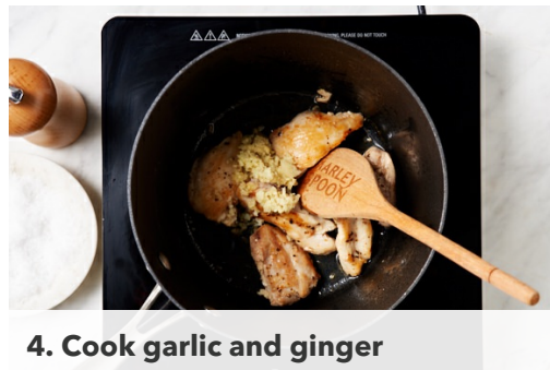
4. Cook garlic and ginger

Heat 2 tbs oil in a large saucepan over medium-high heat. Cook the chicken for 2 mins each side or until browned.