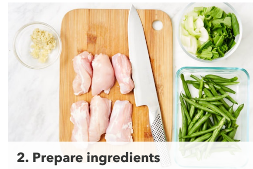
2. Prepare ingredients

Read through the recipe. Rinse the rice until the water runs clear. Put in a medium saucepan with 450ml water , cover and bring to a simmer over medium heat. Reduce the heat to low and cook for 12 mins or until tender and the water is absorbed. Turn off the heat and stand, covered, for at least 5 mins.