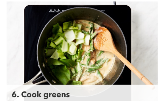
6. Cook greens

Stir in the coconut milk , rice wine vinegar and 60ml (1/4 cup) tbs soy sauce . Bring to a simmer then reduce heat to medium and cook for 8 mins or until the chicken is cooked through and the sauce is reduced slightly.