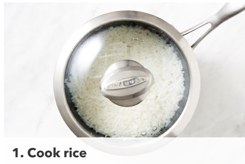
1. Cook rice

Energy 730kcal, Fat 33.6g, Carbs 64.5g, Proteins 38.3g