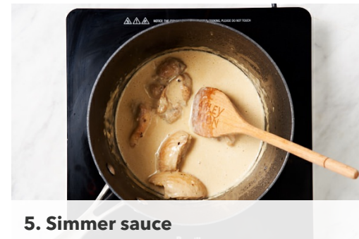
5. Simmer sauce

Add the garlic and ginger and cook for a further 1 min or until fragrant.