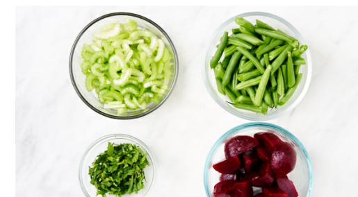
3. Prepare vegetables

Meanwhile, bring a medium saucepan of salted water to the boil for the beans. Put the walnuts in a cold small frypan over medium heat. Cook, tossing, for 2-3 mins until toasted. Remove from the pan and allow to cool slightly, then coarsely chop.