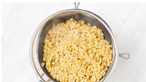
1. Cook freekeh

Energy 599kcal, Fat 30.6g, Carbs 58.7g, Proteins 20.5g