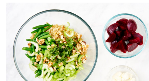
6. Get ready to serve

Drain 2 tbs oil from the marinated goat cheese into a large bowl. Add 2 tbs red wine vinegar and 2 tsp Dijon mustard , season with salt and pepper and whisk to combine.