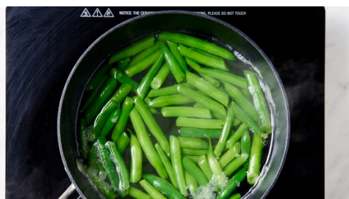
4. Cook beans

Trim the beans , then cut into thirds on an angle. Drain the beetroot and cut into wedges. Thinly slice the celery . Coarsely chop the mint leaves, discarding the stems.