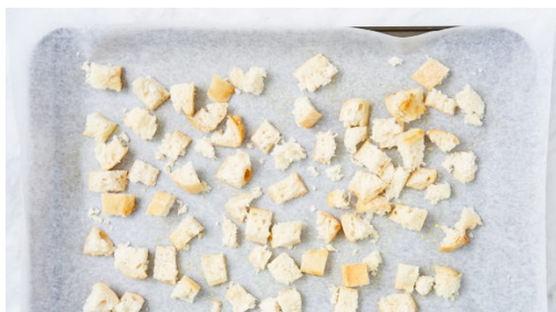
1. Toast bread

Energy 525kcal, Fat 25.3g, Carbs 32.4g, Proteins 39.1g