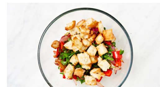
6. Get ready to serve

Heat a chargrill pan over high heat until hot (see cooking tip). Spray the steaks with olive oil (or drizzle lightly with 1 tbs olive oil ) and season with salt and pepper . Reduce the heat to medium-high and cook the steaks for 3-4 mins each side for medium-rare or until cooked to your liking. Remove from the pan and rest for 4 mins.