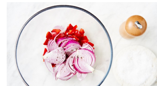
3. Prepare vegetables

Meanwhile, crush or finely chop the garlic . Coarsely chop the capers . Put the garlic , 2 tsp Dijon mustard , 2 tbs red wine vinegar and 60ml (¼ cup) extra virgin olive oil in a large bowl and whisk to combine. Add the capers and season to taste with salt and pepper .