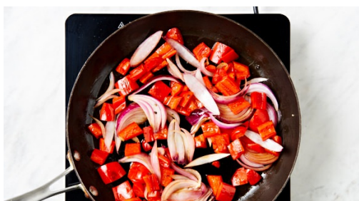
4. Cook vegetables

Cut the onions into thin wedges. Cut the capsicums into 2cm chunks, discarding the seeds and membrane. Put in a large bowl with 1 tbs extra virgin olive oil . Season with salt and pepper and toss to coat.