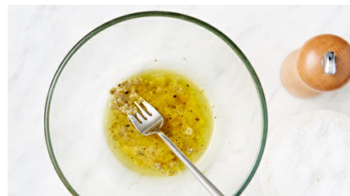
2. Prepare dressing

Heat the oven to 200C. Line an oven tray with baking paper. Cut the bread into 2cm chunks, put on the lined tray and spray with oil (or drizzle bread lightly with 1 tbs olive oil and toss to coat). Bake, shaking the tray occasionally, for 5-6 mins until golden and crisp.