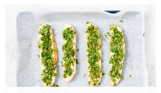
5. Toast baguette

Meanwhile, finely chop the parsley including the stems. Finely chop the oregano , discarding the stems. Put the herbs , garlic , jalapeno , 1 tbs red wine vinegar , 2 tsp chimichurri spice blend (the remaining spice blend won't be used in this dish) and 2 tbs extra virgin olive oil in a bowl. Season with salt and pepper and stir to combine.