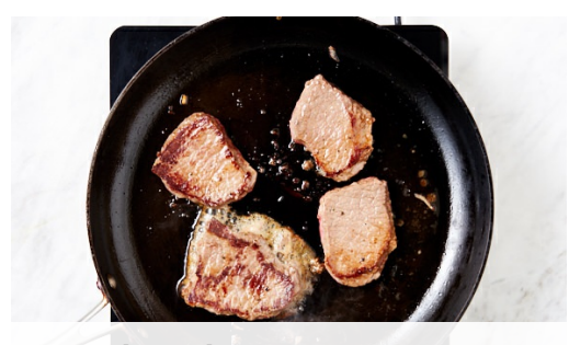
6. Cook steak

Cut each baguette into 4 slices lengthwise, then brush each cut side with 2 tsp chimichurri . Put on the remaining lined tray and bake for 8-10 mins until golden.