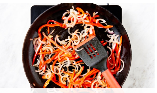
3. Cook vegetables

Meanwhile, thinly slice the onion and capsicums , discarding the seeds and membrane. Finely chop or crush the garlic. Finely chop the jalapeno (see cooking tip).