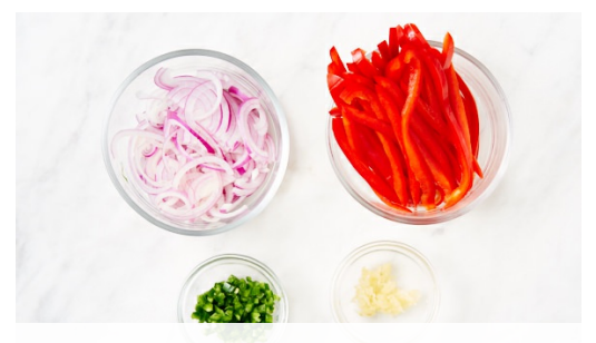
2. Prepare vegetables

Heat the oven to 220C. Line 2 oven trays with baking paper. Cut the unpeeled potatoes into thin wedges then pat dry with paper towel. Put on one lined tray, drizzle with 1 tbs olive oil and season with salt . Toss to coat, then roast for 25-30 mins until golden and tender.