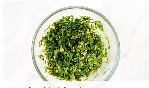
4. Make chimichurri

Heat 1 tbs olive oil in a large deep frypan over medium heat. Cook the onion and capsicum , stirring often, for 5-6 mins until softened and light golden. Remove from the pan, reserving the pan.