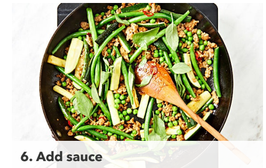
6. Add sauce

Heat 2 tbs grapeseed oil in the pan over high heat. Stir-fry the chilli for 30 secs (see cooking tip). Add the pork mince and garlic and stir-fry for 3-5 mins until the pork is browned.