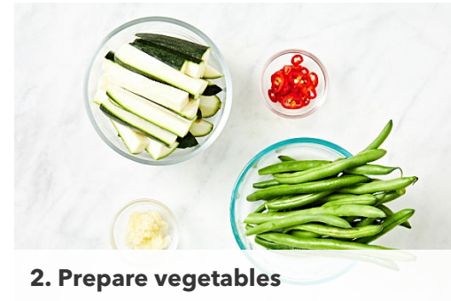
2. Prepare vegetables

Rinse the rice until the water runs clear. Put in a medium saucepan with 450ml water , cover and bring to a simmer over medium heat. Reduce the heat to low and cook for 12 mins or until tender and the water has absorbed. Turn off the heat and stand, covered, for at least 5 mins.