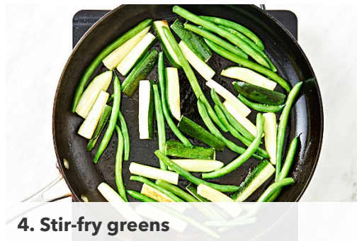
4. Stir-fry greens

Combine the oyster sauce , fish sauce , and 1 tsp sugar in a small bowl. Finely chop the coriander leaves , discarding the stems (see cooking tip).