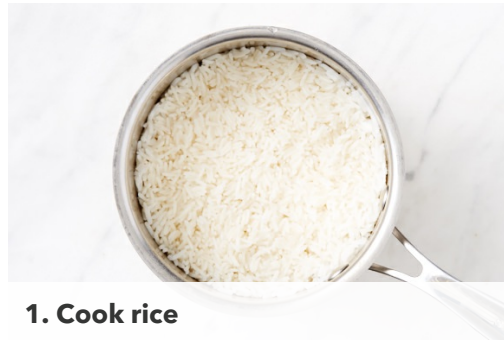
1. Cook rice

Energy 770kcal, Fat 31.1g, Carbs 74.5g, Protein 42.3g