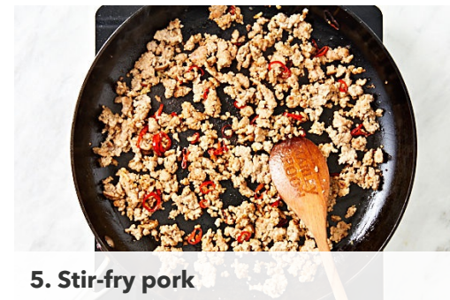
5. Stir-fry pork

Heat 1 tbs grapeseed oil in a large deep frypan over high heat. Stir-fry the zucchini and beans for 4-5 mins until lightly charred and just tender. Remove from the pan.