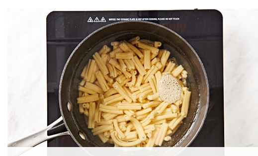
2. Cook pasta

Bring a medium saucepan of salted water to the boil for the pasta. Finely grate the zest of half the lemon , then juice the half (the remaining half won't be used in this dish). Finely chop the tarragon leaves, discarding the stems