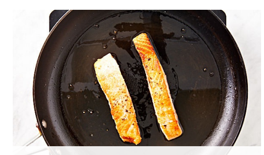
4. Cook salmon

Reserve 80ml (½ cup) cooking water , then drain the pasta and peas.