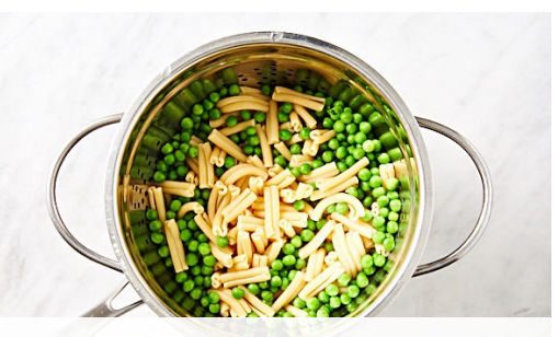
3. Drain pasta and peas

Cook the pasta in the pan of boiling water for 7-8 mins. Add the peas and cook for a further 2 mins or until the pasta is al dente.