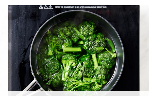
6. Get ready to serve

Reduce the heat to medium-low then add the remaining curry paste , ginger , garlic and ¾ tsp turmeric and cook, stirring, for 1 min. Add the quinoa , tomatoes and sunflower seeds to the pan and stir over medium heat for 3 mins or until well combined and heated through.