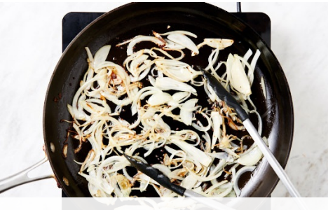
4. Cook onion

Cut the tofu into 2cm-thick slices widthwise. Combine half the curry paste , 1 tbs rice bran oil and 1 tsp turmeric in a large bowl. Season with salt . Add the tofu, in batches, and gently turn to coat. Put the tofu on the lined tray then bake for 15 mins or until browned and heated through.