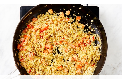
5. Finish quinoa

While the tofu cooks, bring a medium saucepan of salted water to the boil for the broccolini. Heat 80ml (⅓ cup) rice bran oil in a large deep frypan over high heat. Cook the onion and 2 tsp mustard seeds (the remaining mustard seeds won't be used in this dish), stirring, for 5 mins or until the onion is softened and golden around the edges.