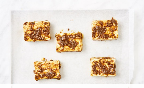
3. Bake tofu

Meanwhile, line an oven tray with baking paper. Carefully remove the tofu , according to the packet instructions, and drain on paper towel. Cut the broccolini into 4 cm lengths, halving the stems lengthwise if thick. Thinly slice the onions . Peel and finely grate the ginger and garlic . Finely chop the tomatoes .