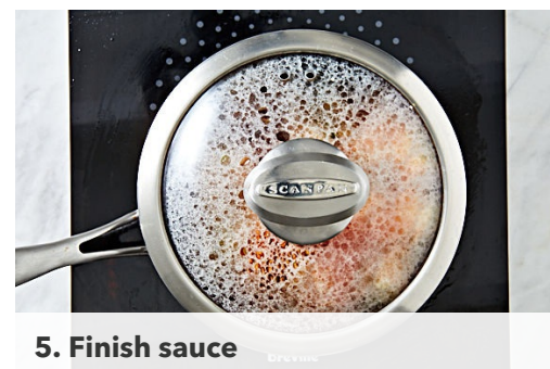
5. Finish sauce

Meanwhile, heat 2 tsp olive oil in a medium frypan over high heat. Cook the chicken , turning, for 2-3 mins until light golden (it will only be partially cooked at this point). Remove from the pan. Add the capsicum to the pan and cook, stirring, for 4 mins or until softened.