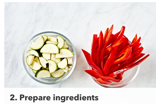
2. Prepare ingredients

Bring a medium saucepan of salted water to the boil for the spaghetti. Crush or finely chop the garlic . Finely chop the oregano leaves, discarding the stems. Put the tomatoes , garlic, oregano ½ tsp sugar and 2 tsp olive oil in a medium saucepan, season with salt and bring to the boil. Reduce heat to low and cook for 8-10 mins until the sauce is thickened.