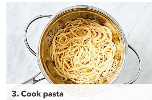
3. Cook pasta

Meanwhile, halve the zucchini lengthwise and thinly slice. Thinly slice the capsicum , discarding the seeds and membrane. Put the chicken breast flat on a board, put your hand on top and cut in half horizontally, then thinly slice into strips.