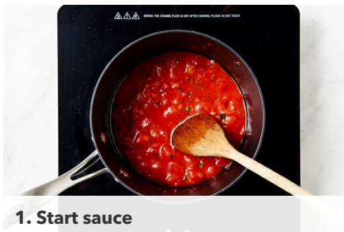
1. Start sauce

Energy 660kcal, Fat 17.7g, Carbs 69.4g, Proteins 50.4g