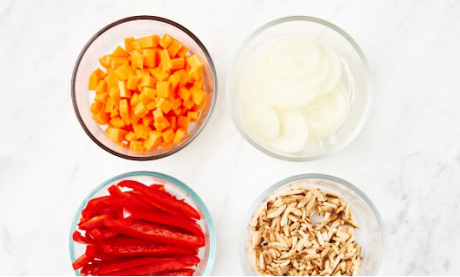
1. Prepare vegetables

Energy 720kcal, Fat 23.2g, Carbs 83.6g, Proteins 38.8g