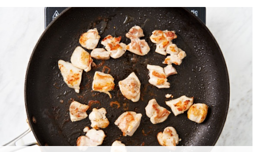
3. Prepare chicken

While the rice is cooking, cut the chicken into 3cm chunks. Heat 1 tbs olive oil in the reserved pan over medium-high heat. Cook the chicken, turning occasionally, for 2-3 mins until the chicken is browned. Season with salt and pepper and remove from the pan.