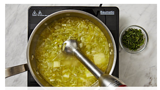
6. Get ready to serve

Add the almonds , raisins and 1 tbs ras el hanout** to the beef . Cook, stirring, for 5 mins or until the beef is beginning to crisp. Season with salt and pepper .