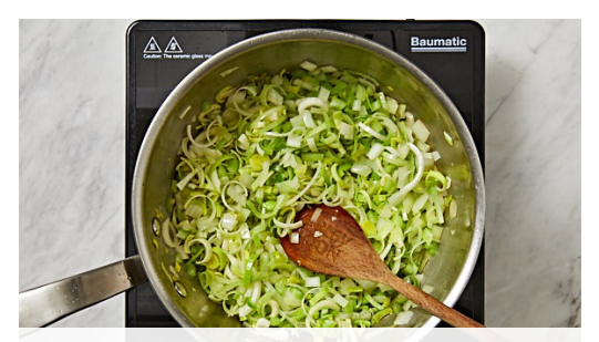
2. Cook vegetables

Read through the recipe . Halve the leek lengthwise and thinly slice the pale stem, discarding any dark green stem or leaves (see cooking tip). Thinly slice the celery . Coarsely chop the onion . Peel and cut the potatoes into 2cm chunks.