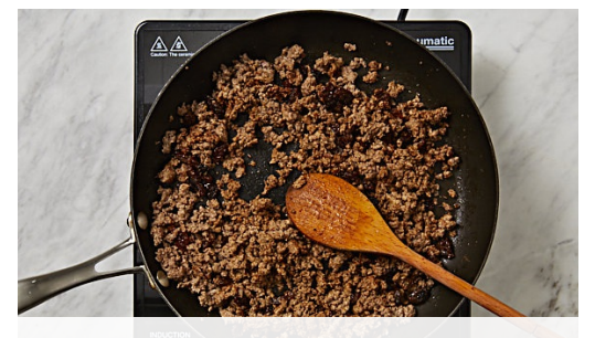
5. Add spices

Meanwhile, heat 1 tbs olive oil in a large frypan over medium-high heat. Cook the beef mince , breaking up the lumps with a spoon, for 2 mins or until browned.