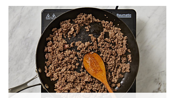
4. Cook beef

Meanwhile, crumble the stock cubes into a heatproof jug, add 1.75L (7 cups) boiling water and stir to dissolve. Add the potato and stock to the pan and bring to a simmer. Reduce the heat to low and cook for 15 mins or until the vegetables are very tender.