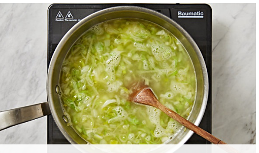
3. Add stock

Heat 2 tbs olive oil in a large saucepan over medium heat. Cook the leek , celery and onion , stirring occasionally, for 5 mins or until softened.