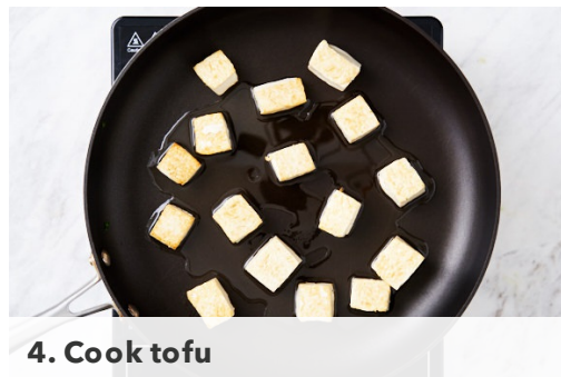
4. Cook tofu

Put in half the coconut milk, peanut butter, 1 tsp soy sauce and 1½ tbs of the kecap manis (the remaining kecap manis and coconut milk won't be used in this dish) in a small saucepan and stir over medium heat for 3 mins or until the sauce comes to a simmer and thickens. Remove from the heat, cover and keep warm.