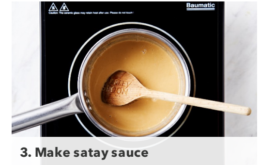
3. Make satay sauce

Meanwhile, carefully remove the tofu according to the packet instructions and drain on paper towel for 5 mins. Cut the broccoli into florets. Peel and coarsely chop the stem. Peel and thinly slice the carrot . Thinly slice the zucchini . Cut the capsicum into thin strips, discarding the seeds and membrane. Cut the tofu into 2cm cubes.