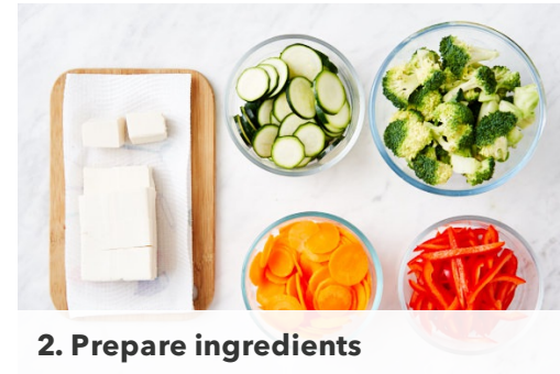
2. Prepare ingredients

Rinse the rice until the water runs clear. Put in a small saucepan with 250ml (1 cup) water, 1 tsp lemongrass powder (see cooking tip) and a pinch of salt . Cover and bring to a simmer over medium heat. Reduce the heat to low and cook for 12 mins or until tender and the water has absorbed. Turn off the heat and stand, covered, for at least 5 mins.