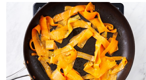
3. Cook carrots

Meanwhile, finely grate the lime zest, then juice. Put the lime zest and juice, sesame oil , 3 tsp of the red curry paste (see cooking tip), 1 tsp sugar , 1 tbs soy sauce and 1½ tbs water in a large bowl and stir to combine. Coarsely chop the peanuts .