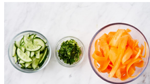
2. Prepare vegetables

Halve the tofu lengthwise, then halve widthwise. Put 1 tbs flour on a plate and season with salt and pepper . Add the tofu and scatter over to coat. Heat 1 tbs vegetable oil in the reserved pan over medium-high heat. Cook the tofu for 3-5 mins each side until golden. Remove from the heat.