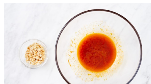
5. Make dressing

Meanwhile, peel the carrot and cut into long strips with a vegetable peeler. Halve the cucumber lengthwise, then thinly slice on an angle. Coarsely chop the coriander , including the stems.