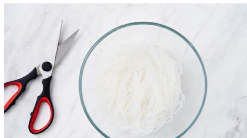
1. Soak noodles

Energy 650kcal, Fat 35.3g, Carbs 51.2g, Proteins 26.0g