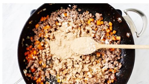
4. Add lamb mince

Heat 1 tbs olive oil in a large deep frypan over medium-high heat. Cook the carrot and onion , stirring occasionally, for 6-8 mins until light golden.