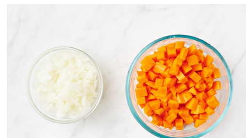
2. Prepare vegetables

Read through the recipe. Peel and cut the potatoes into 3cm chunks. Trim and cut the cauliflower into small florets. Put the potato and cauliflower in a medium saucepan of salted water and bring to the boil. Cook for 10-12 mins until tender. Drain, return to the pan and cover with a lid to keep warm.