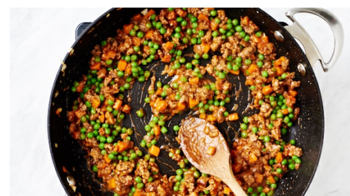
5. Simmer filling

Increase the heat to high, add the lamb mince and cook, breaking up the lumps with a spoon, for 4 mins or until browned. Scatter over the porcini powder and cook for 1 min.