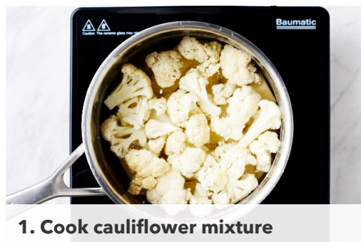
1. Cook cauliflower mixture

Energy 580kcal, Fat 30.8g, Carbs 32.7g, Protein 36.5g