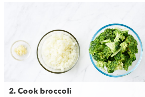
2. Cook broccoli

Crumble the stock cubes into a medium saucepan, add 1.5L (6 cups) boiling water and stir to combine. Bring to a simmer over medium heat.