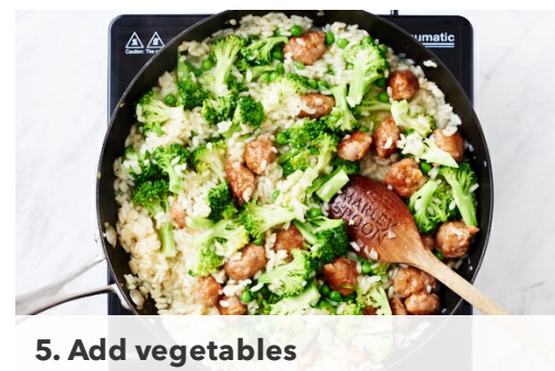
5. Add vegetables

Add the rice , season with salt and pepper and stir for 1-2 mins until the rice is well coated. Add the hot stock , 250ml (1 cup) at a time, stirring continuously and allowing the stock to be absorbed before adding the next, until all stock has been used, the rice is creamy but still retains some bite, and the mixture is thick; this will take about 20 minutes.