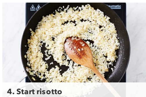
4. Start risotto

Heat 1 tbs olive oil in a large heavy-based frypan over medium-high heat. Squeeze the sausages from their skins and add to the pan in small chunks. Cook, stirring, for 4-5 mins until light golden. Transfer to a plate lined with paper towel. Add the onion and garlic to the pan and cook, stirring occasionally, for 4-5 mins until slightly softened.