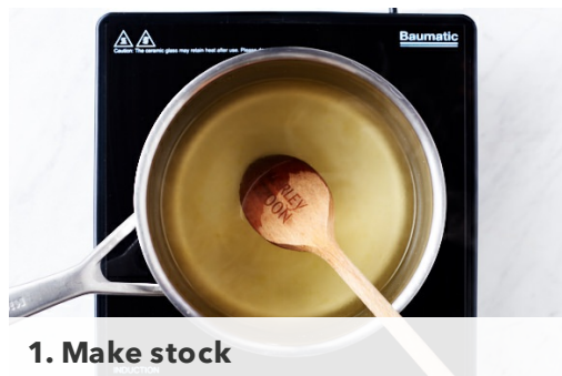
1. Make stock

Energy 835kcal, Fat 45.9g, Carbs 65.5g, Proteins 37.2g