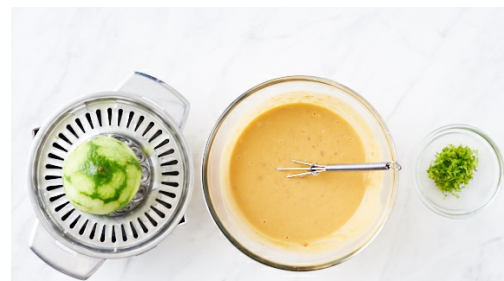
2. Prepare sauce

Heat 1 tbs oil in a deep frypan over high heat. Stir-fry the chicken for 5 mins or until browned. Remove from the pan with a slotted spoon, leaving the oil in the pan.