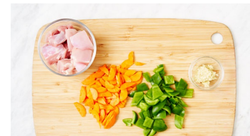
3. Prepare ingredients

Reduce the heat to medium and stir-fry the ginger and lime zest for 1 min or until light golden. Add the carrot and capsicum and stir-fry for 2 mins or until starting to soften. Add the chicken and peanut sauce and cook, stirring, for 2-3 mins until heated through.