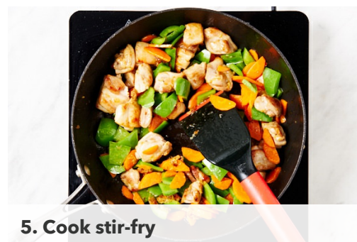
5. Cook stir-fry

Meanwhile, finely grate the zest of half the lime , then juice the half. Cut the remaining lime into wedges. Put the lime juice, peanut butter, 1 tsp sambal oelek (see cooking tip), coconut milk, 1 tbs sugar and 1 tbs soy sauce in a bowl and whisk until well combined.