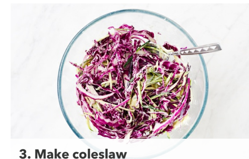
3. Make coleslaw

Meanwhile, cut the buns in half. Coarsely shred the cabbage . Coarsely grate the zucchini . Put the cabbage, zucchini and 3 tsp white wine vinegar in a bowl and stir to combine.