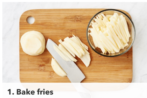
1. Bake fries

Energy 1015kcal, Fat 49.6g, Carbs 92.1g, Proteins 43.5g