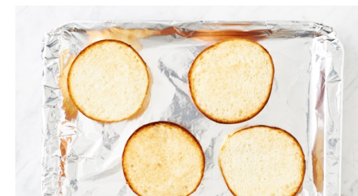
6. Get ready to serve

Heat 1 tbs olive oil in a medium frypan over medium heat. Cook the fish for 2-3 mins each side until golden and cooked through, adding a little extra oil when turning, if necessary. Once the fries are baked, remove from the oven, then change the oven to grill and heat to high.