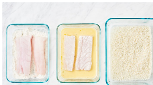
4. Crumb fish

Add the aioli to the cabbage mixture. Season with salt and pepper and stir well to combine.