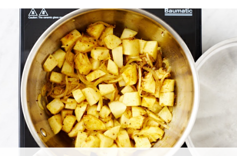
5. Finish Bombay potatoes

Meanwhile, heat 2 tbs olive oil in a large frypan over medium-high heat. Cook the remaining onion , stirring, for 5 mins or until the onion is brown around the edges.