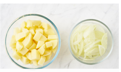
1. Chop vegetables

Energy 680kcal, Fat 22.3g, Carbs 77.9g, Proteins 30.1g