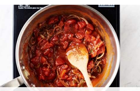
3. Start masala lentils

Meanwhile, pick the coriander sprigs and finely chop the stems. Thinly slice the chillies into rounds, discarding the seeds if less heat is desired (see cooking tip). Crush or finely chop the garlic . Drain and rinse the lentils .