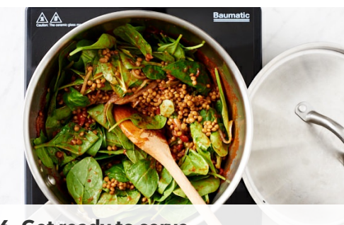
6. Get ready to serve

Add 1 tsp turmeric (the remaining turmeric won't be used in this dish), any remaining garam masala , garlic and potatoes to the onion, and season with salt and pepper . Cook, stirring, for 30 secs or until fragrant. Stir in 80ml (<sup>1</sup>/<sub>3</sub> cup) water and cook, stirring occasionally, for 8-10 mins until the water evaporates.