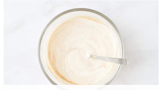
5. Make chipotle yoghurt

While the quinoa is cooking, peel and cut the avocado into wedges. Coarsely chop the tomato . Finely chop the coriander , including the stems. Rinse the corn .