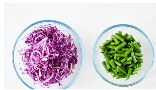
2. Prepare vegetables

Peel and finely grate the ginger . Combine the ginger, 2 tbs soy sauce and 2 tsp grapeseed oil a large bowl and season with pepper . Separate the beef stir-fry strips and add to the marinade. Toss until well coated.