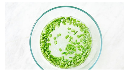
3. Soak noodles and beans

Very thinly slice the cabbage . Trim the beans and cut into 1cm lengths. Finely chop the coriander , including the stems.