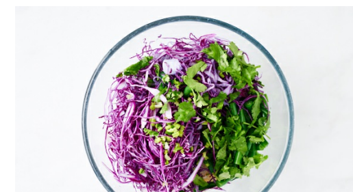
6. Get ready to serve

Heat 1 tbs grapeseed oil in a large frypan over high heat. Add the beef , in two batches, and stir-fry for 1-2 mins until browned (see cooking tip). Remove from the pan.