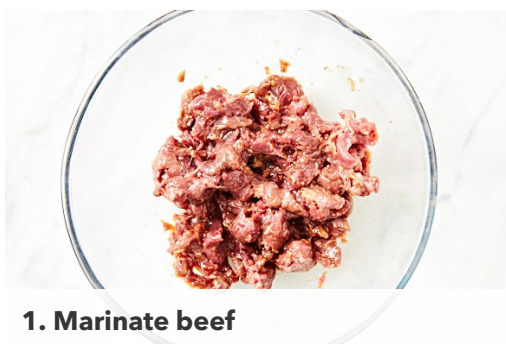
1. Marinate beef

Energy 485kcal, Fat 19.3g, Carbs 25.1g, Proteins 47.6g