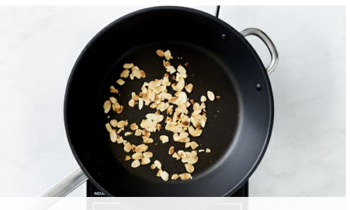
3. Toast almonds

Meanwhile, trim the zucchini , then cut into 'noodles' using a spiraliser or julienne peeler. (Alternatively, thinly slice zucchini lengthwise into ribbons, then thinly slice each ribbon to make 'noodles'.) Drain the zucchini on paper towel. Bring a large saucepan of salted water to the boil for the linguine.