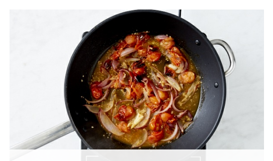
5. Prepare pasta sauce

While almonds are toasting, cook the linguine in the pan of boiling salted water for 6-8 mins until almost al dente. Add peas , reserve 250ml (1 cup) cooking water, then drain mixture in a colander.