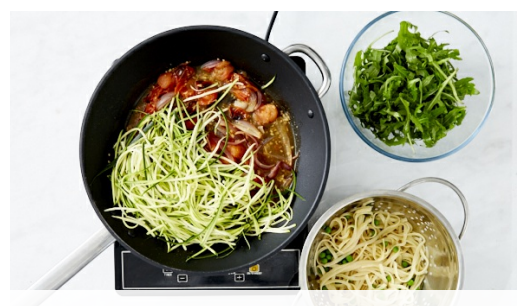
6. Get ready to serve

While pasta is cooking, heat the oil in the reserved pan over medium heat. Add the garlic and cook, stirring, for 1 min or until golden. Add the roasted vegetables, vinegar and sugar , and season with salt and pepper . Add the reserved cooking water and cook, stirring, for 3-5 mins until sauce has thickened.