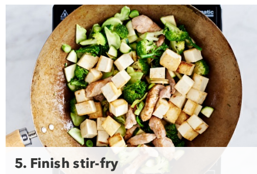
5. Finish stir-fry

Heat 1 tbs vegetable oil in a wok or deep frypan over high heat. In batches, if necessary, stir-fry the pork for 1 min, then remove and set aside. Add 1 tbs oil to the pan. Stir-fry the tofu for 2-3 mins until golden. Using a slotted spoon, remove from the pan and set aside.