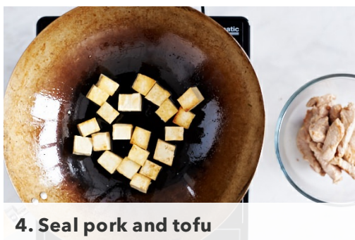
4. Seal pork and tofu

Drain the firm tofu on paper towel and cut into cubes. Trim and quarter the zucchini lengthwise, then thinly slice. Cut the broccoli into florets.