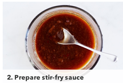
2. Prepare stir-fry sauce

Rinse the rice well. Place in a small saucepan with the water , cover and bring to a simmer over medium heat. Reduce heat to low and cook for 12 mins or until tender and water has absorbed. Turn off the heat and stand, covered, for at least 5 mins.