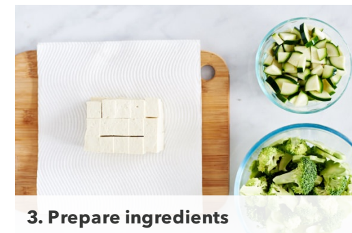
3. Prepare ingredients

While the rice is cooking, combine the tamarind puree , sweet chilli sauce , sugar , soy sauce and vinegar in a bowl.