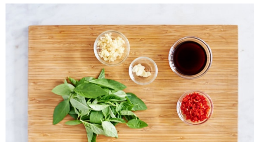
2. Prepare ingredients

Rinse the rice well in a sieve under water. Add to a medium saucepan with the water (see staples list) and cover with a lid. Bring to a simmer over medium heat, then reduce heat to low and cook for 12 mins or until water has absorbed. Turn off the heat and stand, covered, for at least 5 mins.