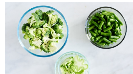
3. Prepare vegetables

While rice is cooking, thinly slice the garlic . Peel and finely grate the ginger . Finely chop the chillies , removing the seeds if less heat is desired. Pick the basil leaves. Combine the fish sauce , vinegar , soy sauce and sugar in a bowl, stirring until the sugar dissolves.