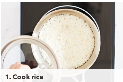
1. Cook rice

Energy 615.0kcal, Fat 14.7g, Proteins 43.8g, Carbs 72.7g