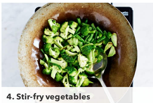
4. Stir-fry vegetables

Trim the green beans and cut into 3cm lengths. Trim the broccoli , then cut into florets and thickly slice the stem.