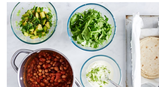
6. Get ready to serve

Combine the coriander, avocado, lime juice, salt and pepper in a bowl. Combine the lime zest with the yoghurt in a bowl.