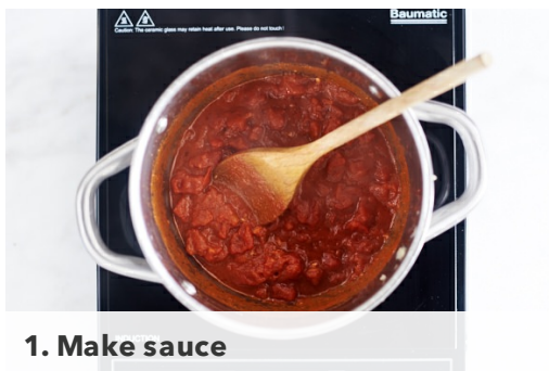
1. Make sauce

Energy 700.0kcal, Fat 27.2g, Proteins 22.6g, Carbs 81.5g