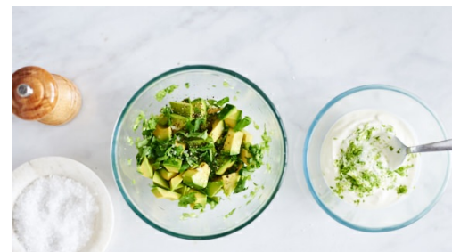
5. Make salsa

Finely chop the coriander leaves, including the stems. Cut the avocado(s) into 1.5cm chunks. Finely grate the zest and juice the lime .