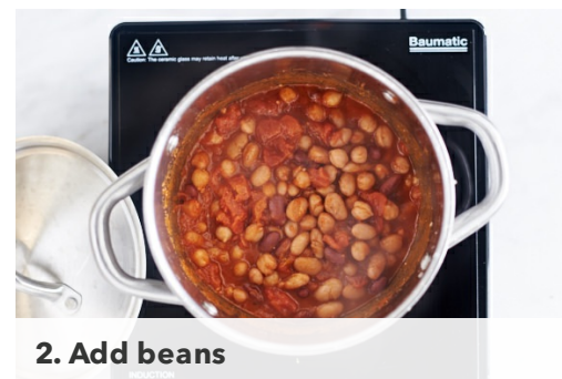
2. Add beans

Preheat oven to 180C. Finely chop or crush the garlic . Place the tomatoes in a medium saucepan with the garlic, spice mix, oil, sugar, salt and pepper . Bring to the boil and simmer over medium heat for 6 mins or until slightly thickened.