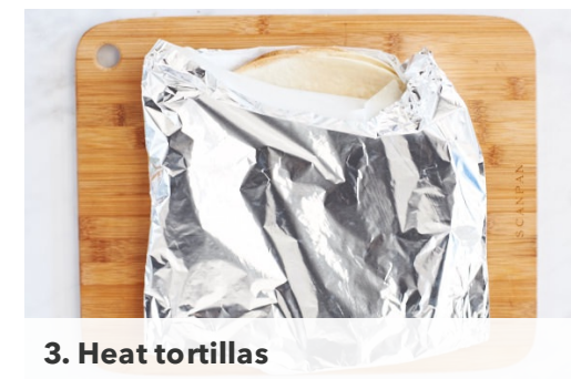
3. Heat tortillas

Drain and rinse the beans , then stir into the tomato sauce . Cook for a further 5 mins or until the beans are warmed through and the sauce has thickened. Reduce heat to low and keep warm.