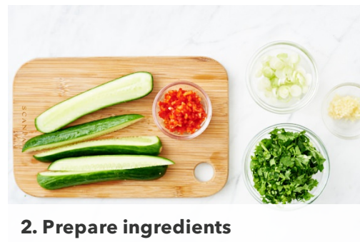
2. Prepare ingredients

Put the eggs in a small saucepan of water and bring to the boil over high heat. Cook for 7 mins. Remove from the water with a slotted spoon and immediately cool under cold water. Peel and cut the eggs in half. Set aside.