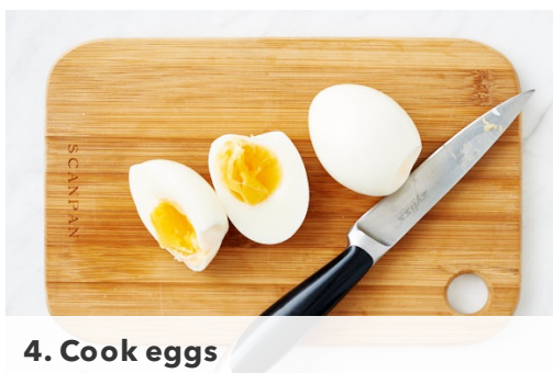
4. Cook eggs

Remove 2 eggs from the fridge to come to room temperature (see cooking tip). Rinse rice until the water runs clear. Put in a medium saucepan with 450ml water , cover and bring to a simmer over medium heat. Reduce the heat to low and cook for 12 mins or until tender and water is absorbed. Turn off the heat and stand, covered, for at least 5 mins.