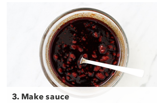
3. Make sauce

Meanwhile, heat 1 tbs vegetable oil in a wok or large deep frypan over high heat. Stir-fry the pork for 5 mins or until golden and crisp. Add the garlic, spring onion and chilli (see cooking tip), reduce the heat to medium and stir-fry for a further 2 mins or until softened.