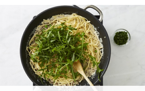
6. Get ready to serve

While the linguine is cooking, add the beef , stock , cream and peppercorns to the onion mixture. Cook, stirring occasionally, for 5 mins or until sauce has reduced slightly.