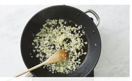
3. Cook aromatics

Heat half the oil in a large deep frypan over high heat. Add the beef and cook for 3-5 mins until browned, stirring to break up any lumps. Season with salt and pepper . Remove beef from pan and set aside.