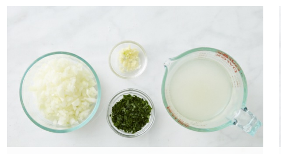
1. Prepare ingredients

Energy 860.0kcal, Fat 37.1g, Proteins 44.8g, Carbs 83.7g