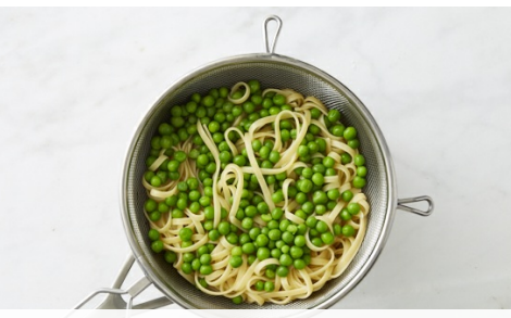
4. Cook linguine and peas

Add the remaining oil to the pan and reduce the heat to medium. Add the onion and garlic , and cook, stirring, for 3-5 mins until lightly golden.