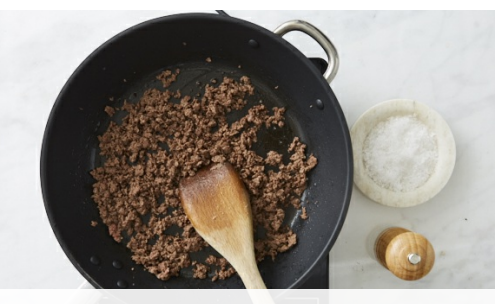
2. Cook beef

Finely chop the onion . Crush or finely chop the garlic . Finely chop the parsley , including the stems. Put the stock powder in a heatproof jug, add the boiling water (see staples list) and stir to combine. Bring a large saucepan of salted water to the boil for the linguine and peas.